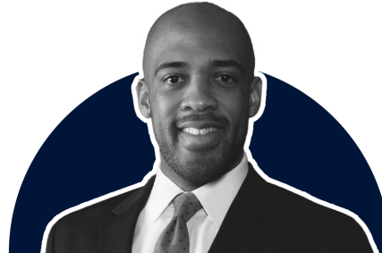
LT. GOV. MANDELA BARNES

Senator Ron Johnson Has Not Indicated Whether He Will Accept The Election Results. The Washington Post surveyed numerous candidates on whether they will accept the results of their contests. Ron Johnson fell in the “No/Did Not Respond” category. [Washington Post, 9/18/22 ]