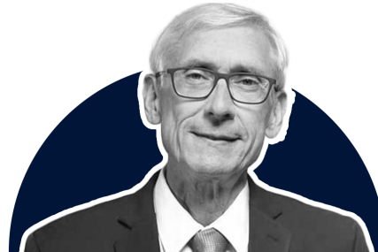
GOV. TONY EVERS