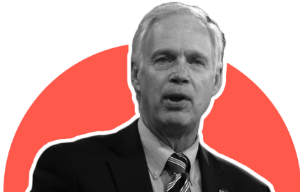
SEN. RON JOHNSON