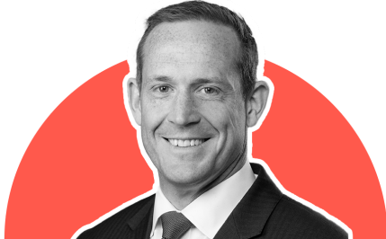
REP. TED BUDD