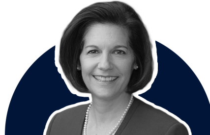
SEN. CATHERINE CORTEZ-MASTO

Adam Laxalt May Sue To Challenge The Conduct Of The Election. “Mr. Laxalt, a former state attorney general, helped lead the effort to overturn Mr. Trump’s 2020 defeat in the state, spoke last year about plans to file lawsuits to contest the 2022 election and called voter fraud the “biggest issue” in his campaign.” [New York Times, 9/18/22 ]