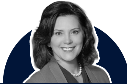
GOV. GRETCHEN WHITMER

Tudor Dixon Refuses to Say Whether She Will Accept the Results of The Election. During an interview with New York Magazine, Dixon's campaign representatives refused to answer questions about accepting election results: " She pointedly did not say whether she will accept the results. " [New York Magazine, 10/16/22 ]