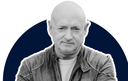
U.S. SENATOR MARK KELLY

Blake Masters Refuses To Say Whether He Will Accept the Results of The Election. “ Blake Masters in Arizona...declined to commit to accepting the 2022 results. [...] Mr. Masters, the Trump-backed Republican nominee for Senate, baselessly predicted to supporters in July that even if he defeated Senator Mark Kelly, the incumbent Democrat, enough votes would somehow be produced to flip the result. ‘There’s always cheating, probably, in every election,’ Mr. Masters said. ‘The question is, what’s the cheating capacity?’” [New York Times, 9/18/22 ]