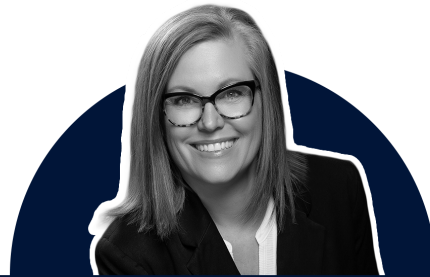
SEC. OF STATE KATIE HOBBS